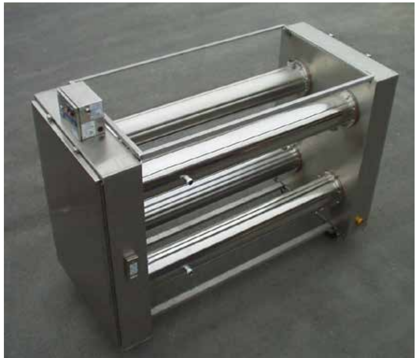
IL-EXP-5000-20 x 4

The onboard nitrogen purge system allows them to use the equipment in different locations through out the processing facility.