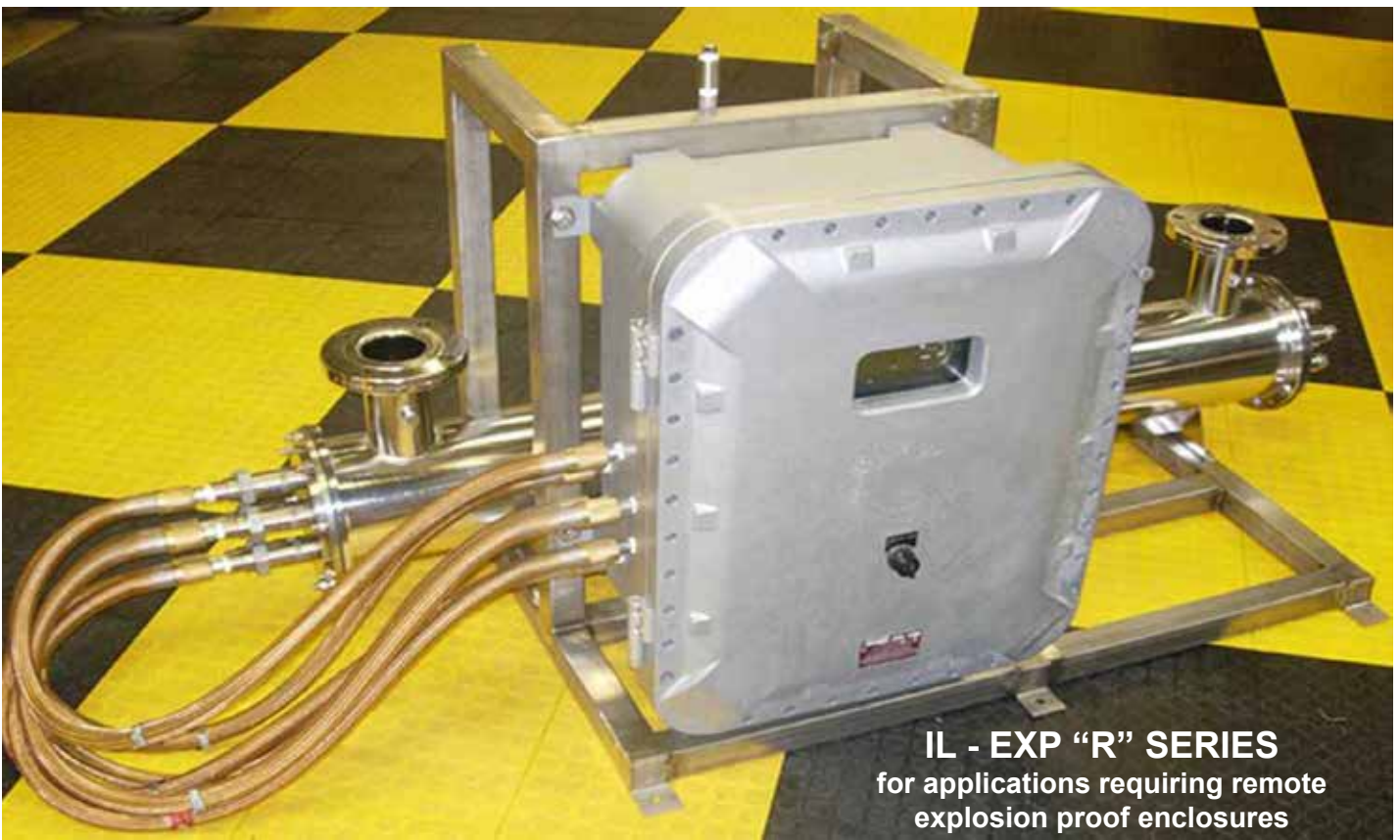
IL - EXP "R" SERIES for applications requiring remote explosion proof enclosures